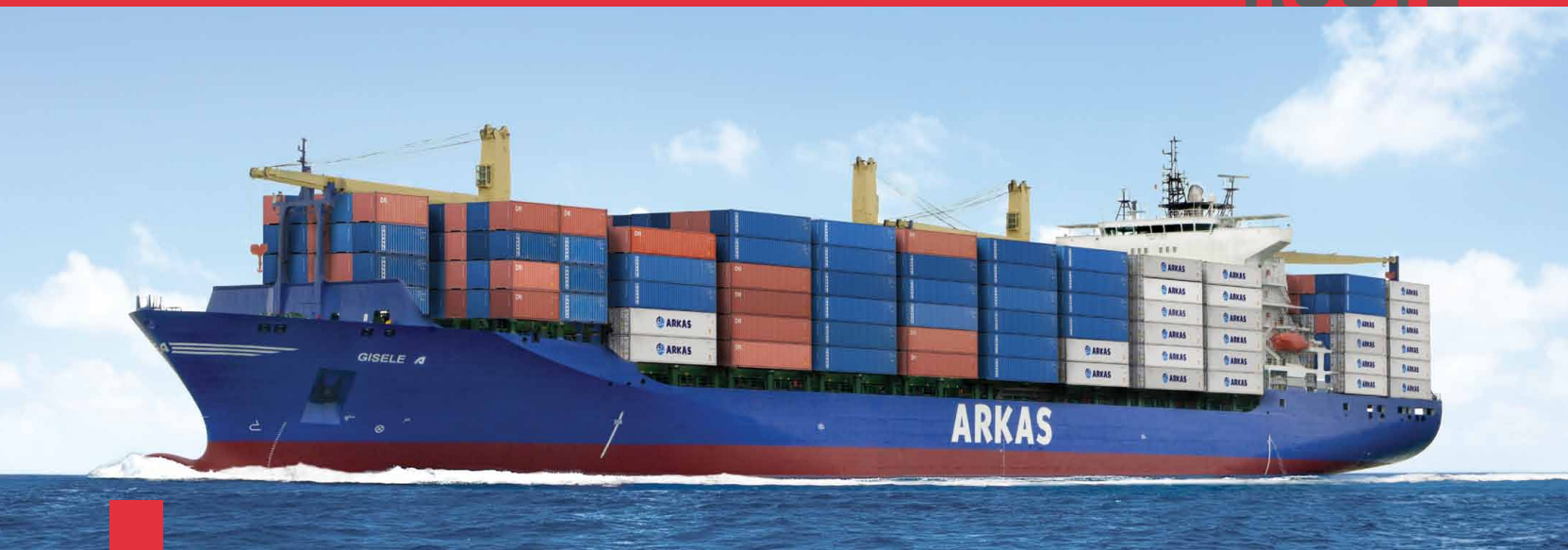
▲ M/V Gisele A