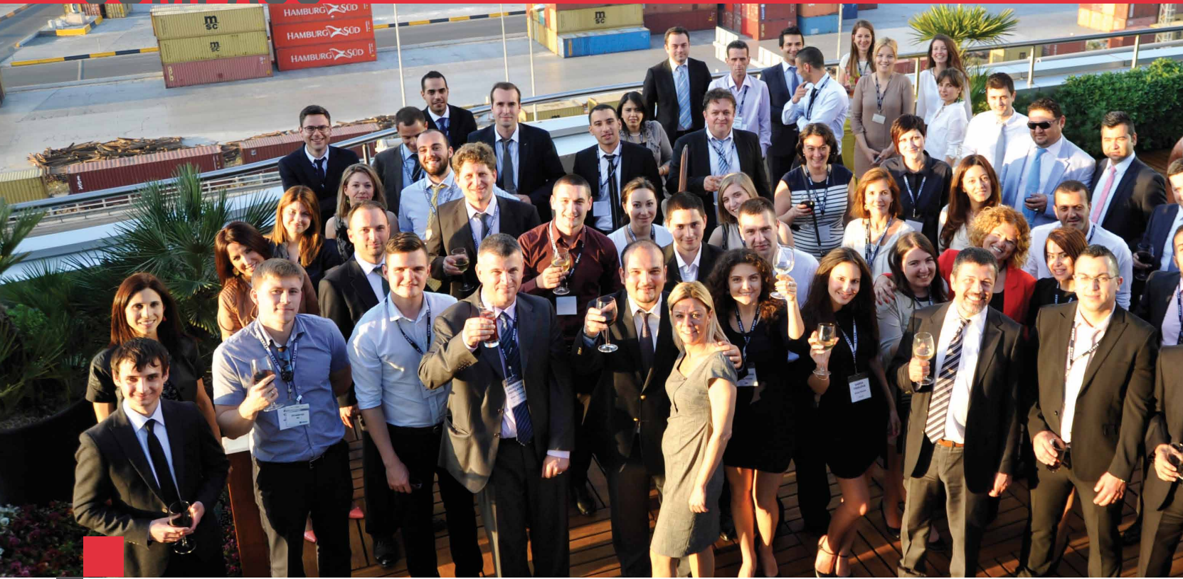
Black Sea and Mediterranean agencies ▲